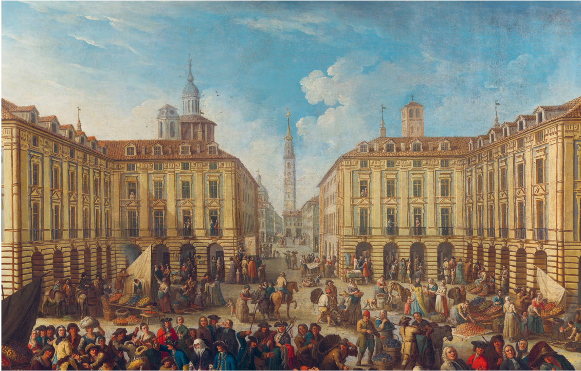
fig. 4 Giovanni Michele Graneri, The Market Square in Porta Palazzo, Turin , ca. 1749–1756, 159.5 × 212.5 cm

In Juvarra's 1729 design for the street and squares leading to Porta Palazzo, high-rise and high-density lodgings were combined. Juvarra used a giant Doric order throughout, as a symbol of royalty. fig. 4 High above the crowded market area, the metopes in the giant entablature were stretched downward between pilasters, allowing full-size windows to be opened