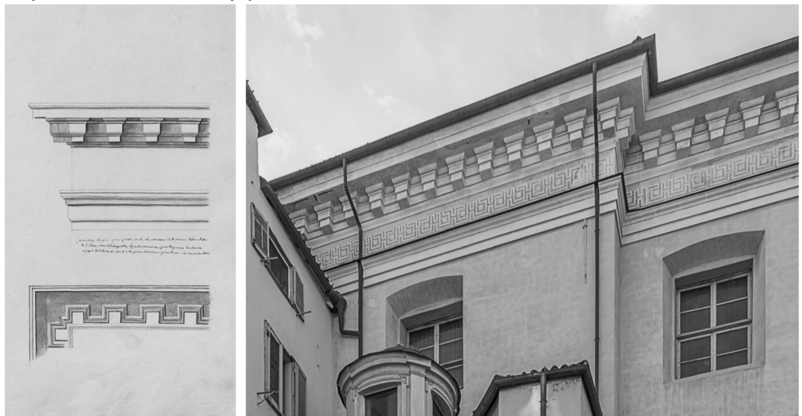
fig. 1 Left: Giovanni Francesco Baroncelli, cornice from Inventioni d'ornamenti ... (1666) Right: detail of the cornice on the north-west side of the church of San Francesco da Paola

Even the earliest experiments in ducal urbanism, such as Vincenzo Scamozzi's designs for the main street of the new city, Contrada Nuova, were characterized by a reductionist attitude. This attitude also applies to the early facade models made by ducal engineers. Simplified versions of the classical cornice appeared, based on the combination of thin, flattened architraves, packed rows of consoles in the space of the frieze, and slender coronas. Surviving sketches from the drawing boards of seventeenth-century ducal architects allow us some insight into the development of this simplified language. 6