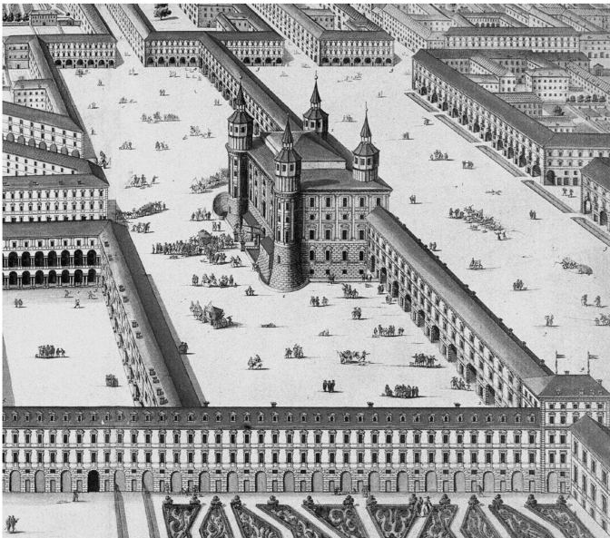
fig. 2 Fictional view of the new city centre around Piazza Castello, from Theatrum Sabaudiae (Amsterdam, 1682), detail

monotonous — and at the time of the Theatrum's publication, mostly unbuilt — urban facades rising from the regularly planned grid of the città nuova , the cornice appeared an almost mechanical element: a beam of zigzagging parallel lines, or a toothed gear, unrolled on the buildings by a giant cogwheel. Also effective in defining Turin's image until