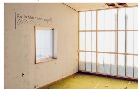
15 Eliana Perotti and Katia Frey, "Images of Rahm," from the untitled exhibition handout for The Power of Mushrooms: Berta Rahm's pavilion for the Saffa 58 , iteration 2.