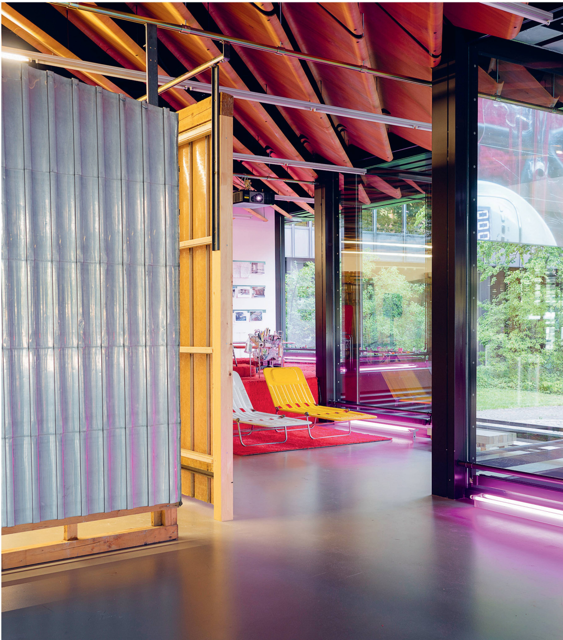
fig. 8 a, b, c View of the exhibition installation and exhibition iteration "Close Encounters" within the exhibition The Power of Mushrooms: Berta Rahm's Pavilion for the Saffa 58 .