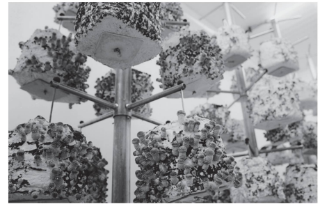
fig. 6 a, b