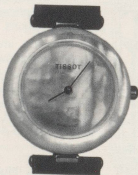
The PearlWatch made out of mother of pearl. A real pearl amongst watches??