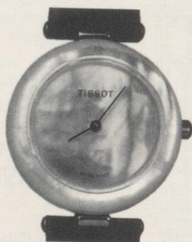
The PearlWatch made out of mother of pearl. A real pearl amongst watches??