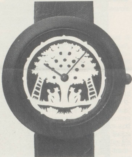
The WoodWatch with "Scherenschnitt" faces.