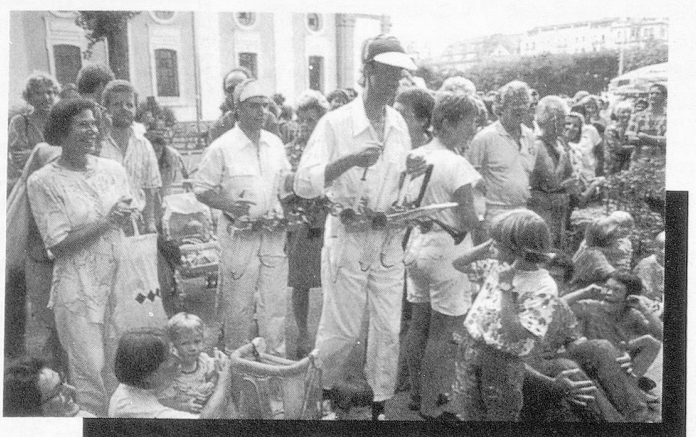
Crazy music produced by bicycle pumps and car horns.