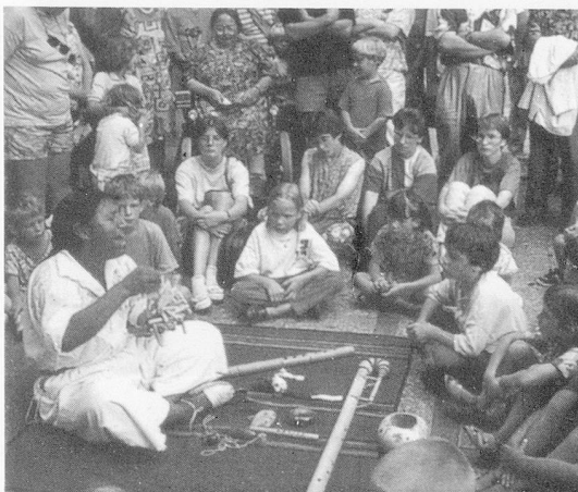
Songs and music from Ecuador.

musicians, winners and non-winners alike, thought the festival had been a tremendous success and want to come back next year for a repeat. The organisers agree with them, calling their own festival an alternative to the classical interna-