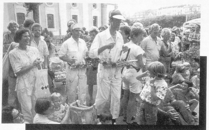
Crazy music produced by bicycle pumps and car horns.