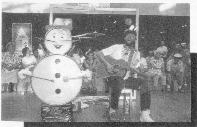
One man show from UK with assistance from a robot snowman.

tional music festivals which are very costly and mostly reserved to the elite. In contrast, at the Lucerne street musicians festival, everyone can participate and anyone can watch.