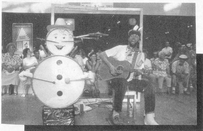
One man show from UK with assistance from a robot snowman.

tional music festivals which are very costly and mostly reserved to the elite. In contrast, at the Lucerne street musicians festival, everyone can participate and anyone can watch.