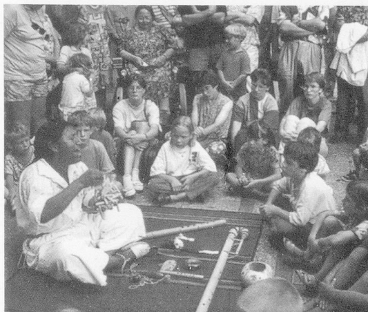
Songs and music from Ecuador.

musicians, winners and non-winners alike, thought the festival had been a tremendous success and want to come back next year for a repeat. The organisers agree with them, calling their own festival an alternative to the classical interna-