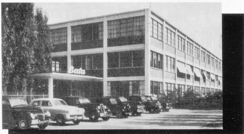
The Bata factory in Möhlin as it existed in 1960. Today, sadly, the manufacturing of shoes at this plant is at a standstill.

Switzerland's best known shoes have actually a foreign origin. Thomas BATA, born in 1876, was a Czech. He was not only the first to produce shoes by machines, but he also built next to his factories whole housing estates for his workers, complete with gardens, parks and shops. One of these typical housing estates still exists in Möhlin (Aargau).