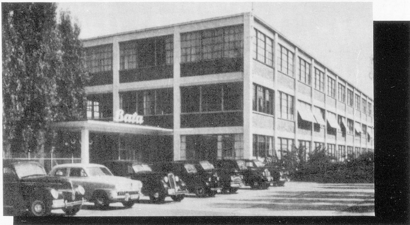
The Bata factory in Möhlin as it existed in 1960. Today, sadly, the manufacturing of shoes at this plant is at a standstill.

Switzerland's best known shoes have actually a foreign origin. Thomas BATA, born in 1876, was a Czech. He was not only the first to produce shoes by machines, but he also built next to his factories whole housing estates for his workers, complete with gardens, parks and shops. One of these typical housing estates still exists in Möhlin (Aargau).