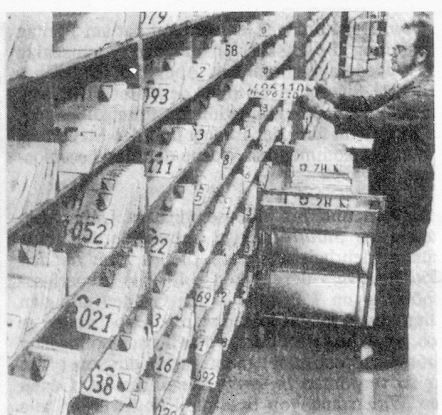
At a motorcar registration office, thousands of number plates are stored for the winter, awaiting spring when their owners will return to claim them again for the next summer season.

other solution than to park their vehicle on the road, protecting them against the weather with plastic covers. There is apparently no law in Switzerland against leaving a car in a free parking zone for several months without number plates. But the practice is creating a lot of ill-feelings amongst the car owners who continue to use their vehicles during the winter, as they find almsot all free parking spaces permanently occupied by the ever increasing number of "mothballed" cars.