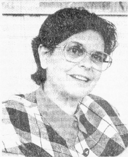
Ruth Dreifuss, the new Federal Councillor.