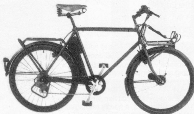
The Swiss Army Bike, a "Göppel" for everyone? Not exactly. Seven gears, 18 kgs. SFR 3000.-. At that price you might as well buy a motorbike.

A "Göppel", as the Swiss soldiers call their bikes, must be able to withstand quite a lot of punishment, so Swiss army bikes have always been built very solidly. This bike is now also available for non-military users. It is green, weighs 18 kgs. has 7 gears, hydraulic brakes and can be loaded with up to 100 kg of baggage. Price tag: a hefty 3000.-SFR. At this price it must undoubtedly be the Rolls Royce among bikes. According to the picture, the price still does not seem to include a headlight, a notorious absence on most Swiss army bikes.PIX