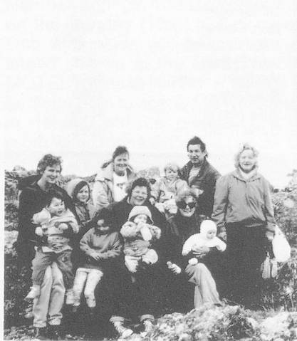
The Wellington Swiss Club Trampers visiting the Seal colony.

An easy walk! We counted 115 bulls, they enjoyed our inspection! An outing which can be recommended to everybody, your and old.