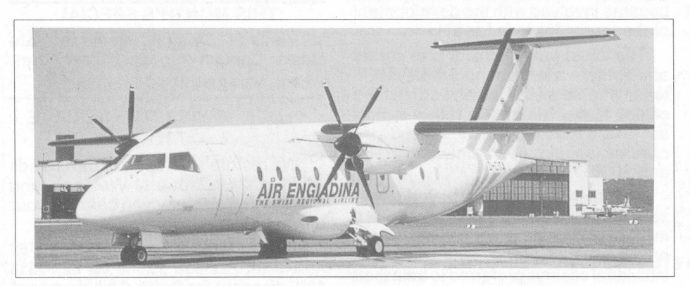
The airline is the first to use the new Dornier 328.

The company has also become the first airline in the world (ahead of deliveries to the United States, Africa and Asia) to purchase the new Dornier 328 aircraft. At SFR 13 million, this is the largest single investment ever made by the Swiss carrier. The 31-seater plane is the most advanced regional aircraft of its kind, combining high cruising speed and low operating costs with environment-friendly operation and generous passenger comfort.