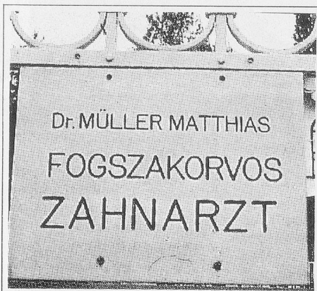
A familiar looking name for a "Hungarian" dentist. Whatever his nationality, his services are much cheaper than in Switzerland.