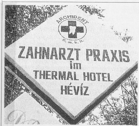
At the thermal hotel "Heviz" even the teeth can take a cure.

To go on holiday to have your teeth attended to is certainly a new kind of tourism and the Hungarians are making the most of it. Realising that having your teeth fixed in a nice place rather than in a drab city is far more pleasant for the patients, Hungarian dentists were quick to open up dozens of new dental clinics and practices in the most sought-after Hungarian spa and holiday resorts. And to better attract their foreign clients, the shields are also written in German as the pictures show.