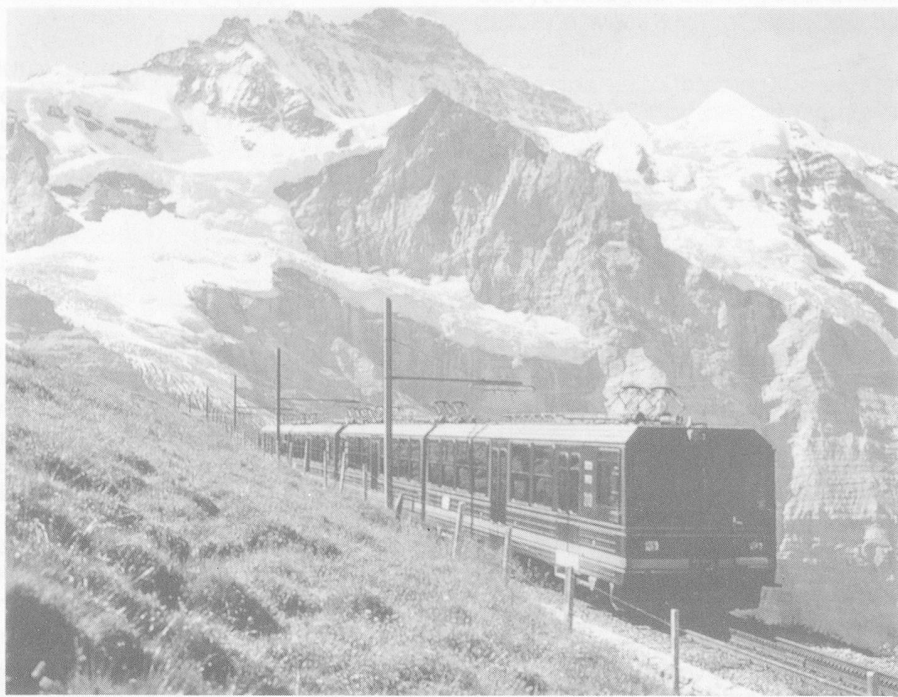
The scenic Jungfrau region symbolises the attraction of Switzerland as a dream destination.

Visitors to Switzerland like the product - but not the price.