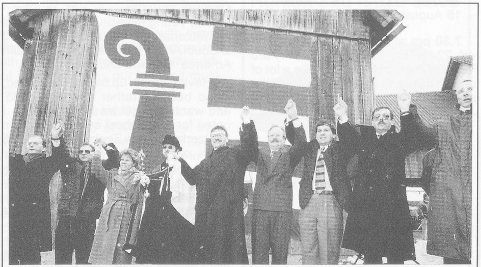
The local Mayor of Vellerat together with members of the Jura Government during the celebrations in front of a huge Jura flag.