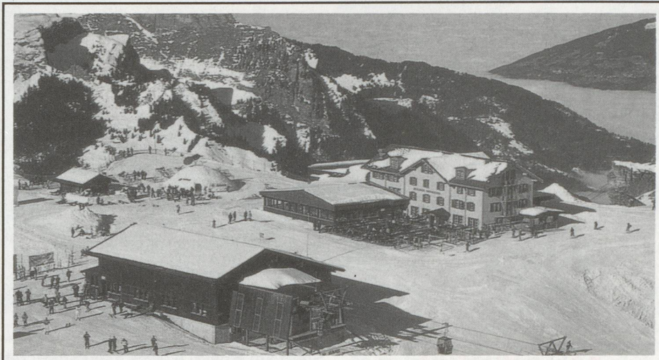
View of the Männlichen, high above Wengen. In the background, the uniform grey cloud covering the Lake of Thun and for that matter the whole of the Swiss plateau.

All of you who lived in Switzerland and had to spend your winters down on the "flat land" will remember the horrible grey winter weather which seemed to last for weeks on end when all you could see was a uniform grey layer of clouds which never let any real sunshine through. It certainly was most depressing.