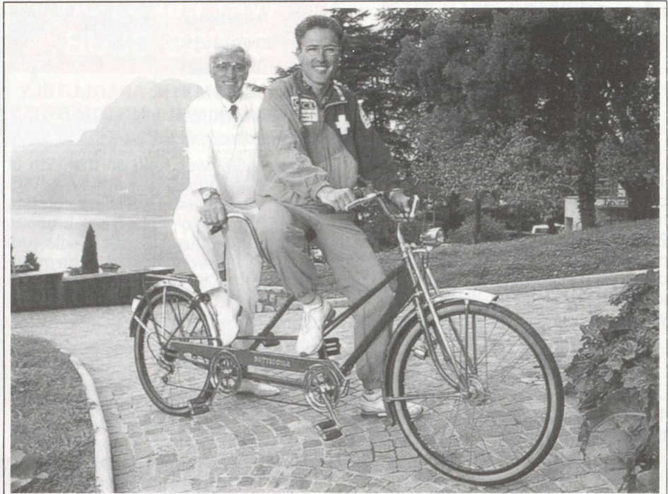
The two World Champions in tandem. Of course Alex Zülle is in front.

When the Swiss Alex Zülle recently became World Champion cyclist in the time trial, the first to congratulate him on his success was no other than Ferdy Kübler who had won the same trophy some 45 years ago in Varese, Italy.