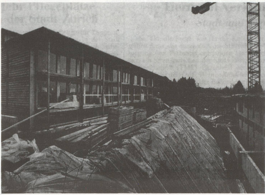
The houses under construction with the main materials being timber and lots of glass.

Apart from the typical Swiss chalets, practically all the housing construction in Switzerland has always been done in concrete or bricks.