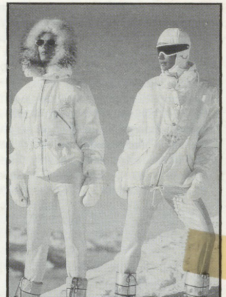
The latest fashion in Ladies ski wear in Switzerland.