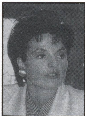
The new Minister of Police and Justice, 34 year old Ruth Metzler , from Canton of Appenzell-Innerrhoden, replacing Arnold Koller.

The election of 2 new Federal Councillors to the Swiss Parliament took place in Berne on 11 March 1999. The resignation of Federal Councillor Arnold Koller and Flavio Cotti both from the CVP-Party made this necessary.