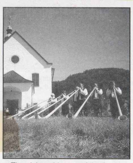
The alphorn blowers of the Auckland Swiss-kiwi yodel group performing while in Switzerland.

(Registered at the G.P.O. Wellington as a Magazine) Monthly Publication of the Swiss Society of New Zealand (Inc.) Group New Zealand of the Helvetic Society