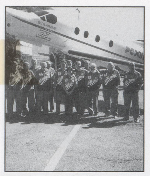
Auckland Swiss-kiwi yodellers visiting the Pilatus aeroplane factory in Stans.