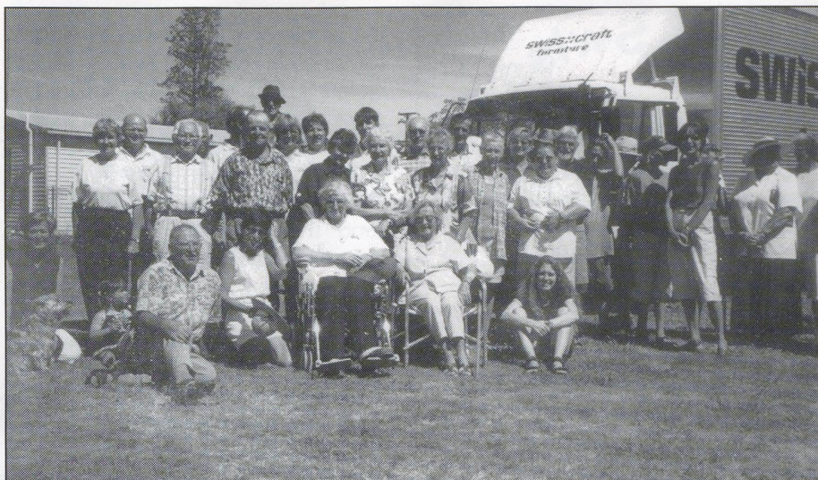
Annual picnic at Eureka; A selection of some prominent Swiss-Kiwis in attendance, including some visitors from Switzerland.

The Hamilton Swiss Club AGM will be held on Saturday, 21st April, at 7.30 pm , at Swisscraft Premises,