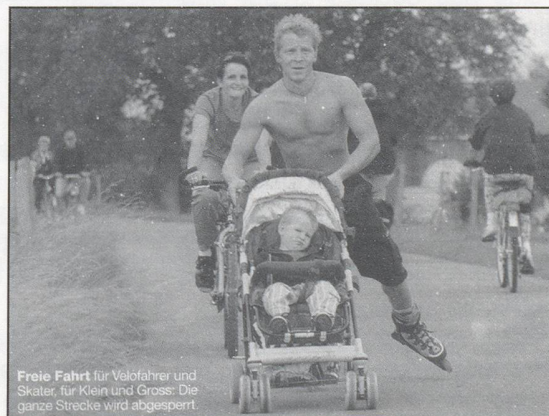
Freie Fahrt für Velofahrer und Skater, für Klein und Gross: Die ganze Strecke wird abgesperrt.

On Saturday June 8 there will be a 'roller-parade' in Neuenburg along the lake of Neuenburg, with inline-skates, kickboards and scooters ('Trottinetts' as the Swiss call them). Let's hope the weather is fine for the weekend! Ed.