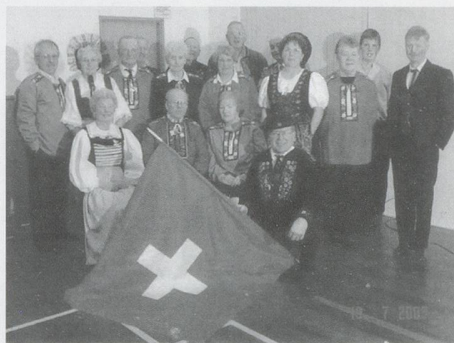
Augustfeier 2003, Eureka.

Christmas Function will take place on Sunday, December 7, 11 am at the Newstead School. Please note new venue as the Tamahere School is undergoing major alterations and additions. Newstead