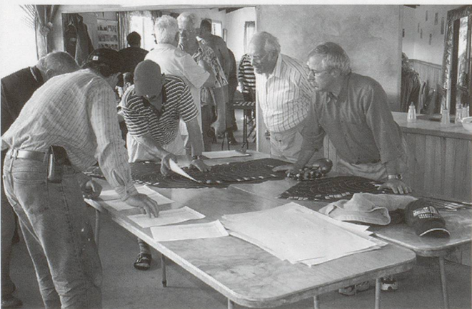
Finding a winner