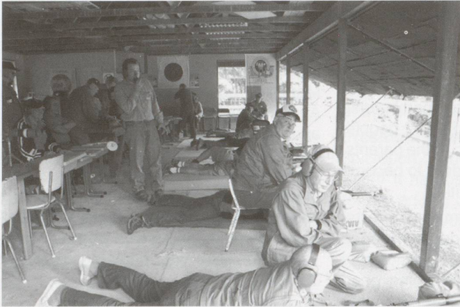
Shooting in progress

A highlight for the Auckland Shooting section was a visit by the Swiss Senior Shooting Federation on March 20, 2004.