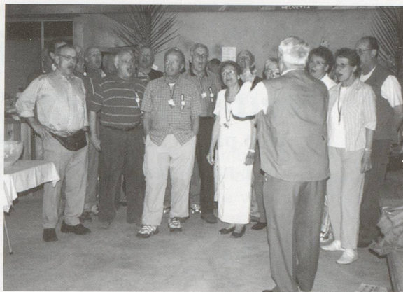
The Swiss Shooters with their special contribution to the entertainment.