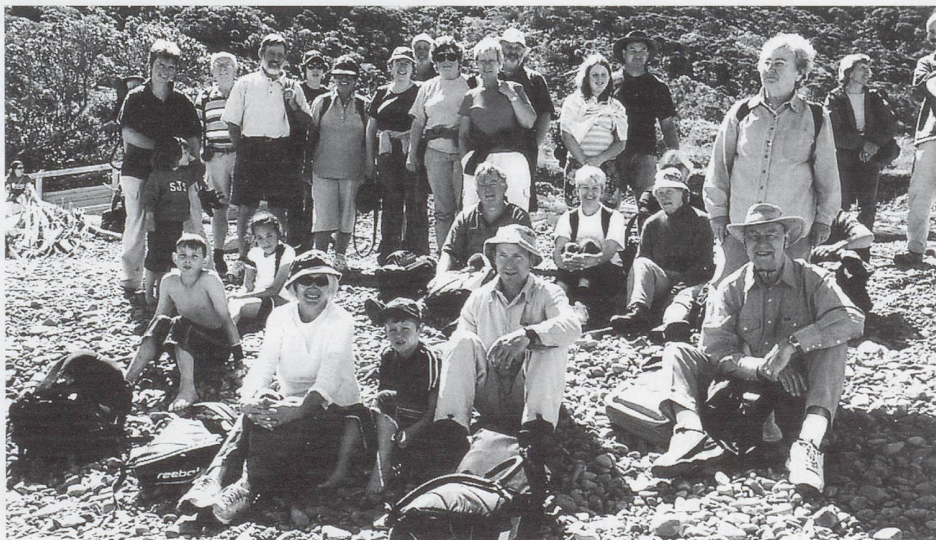
The Kapiti trip group