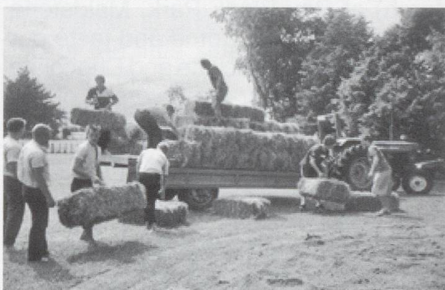
Unloading the hay bales by the 'schwingers'... their warm up!