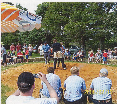
The wrestlers and audience at the Taranaki Swiss Club picnic 2005.