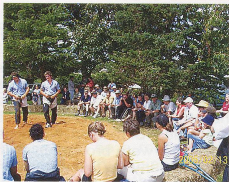
Two Swiss tourists battle it out in front of a captive audience.