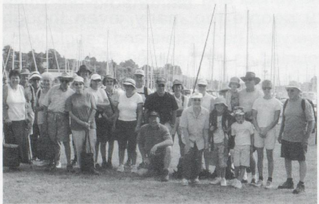
The family walk group photo