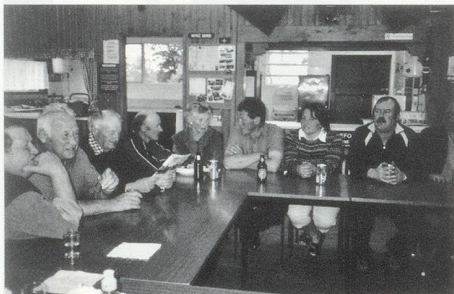
Committee members enjoying a Christmas Barbecue on November 25.

Your committee has been busy ... holding working bees to keep our club house looking spic 'n' span!!! Instead of trying to get the full committee at the club house on the one day (which is mission impossible!!), everyone put their name down to undertake a task. It worked wonderfully well!!! The club house and surroundings look spotless ... actually everything looks like new!!! Not bad for a 25 year old club house. Many thanks to all of you for your tremendous effort.