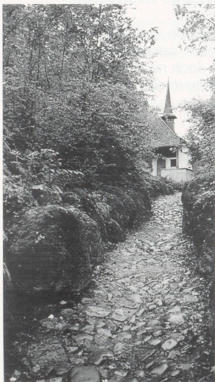
The William Tell chapel at Immensee on the Zuger See, south of Zurich.

In honour of the famous Kirsch from Zug, here is a recipe.