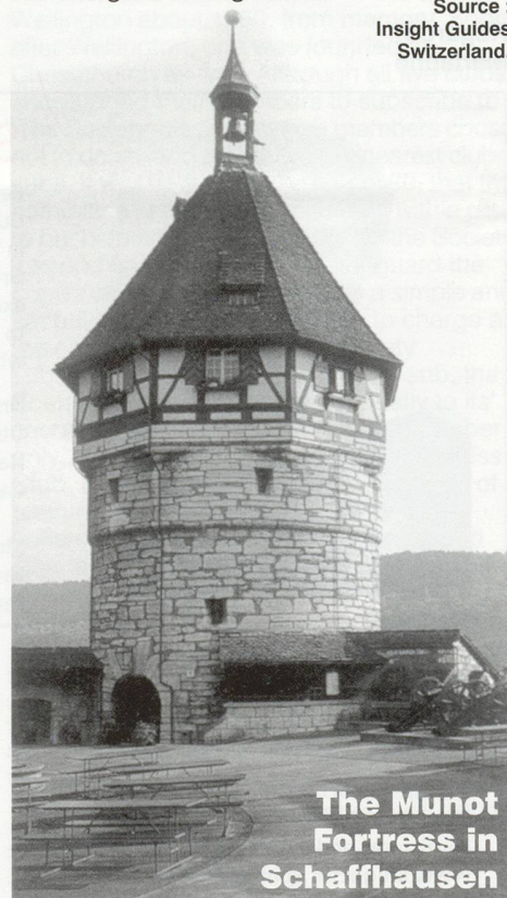
The Munot Fortress in Schaffhausen