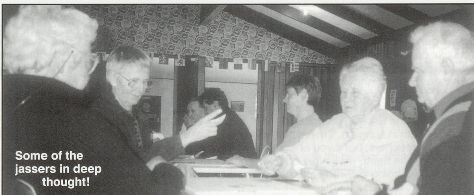
Some of the jassers in deep thought!