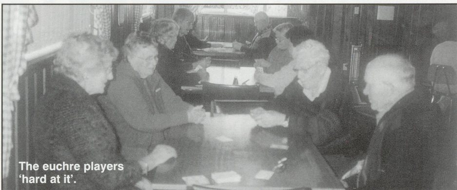
The euchre players 'hard at it'.