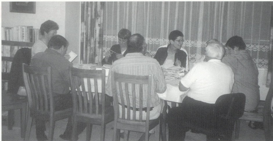
Behind the Scenes: