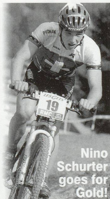
Nino Schurter goes for Gold!

One of the gold medal winners, Nino Schurter (U23 Cross Country) on the climb to the top of mount Ngongotha in Rotorua.