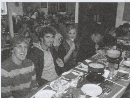
All ready to start on the delicious fondue

A yummy fondue was served at the clubhouse in Wainuiomata, together with a crunchy salad and a delicious vanilla custard dessert.