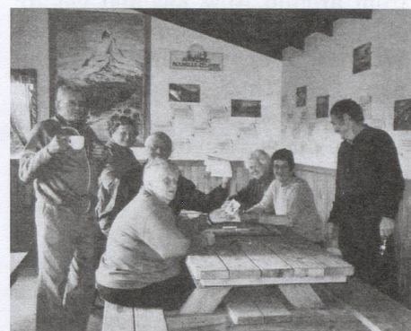
The jassers... the Taranaki lot still smiling after their narrow loss

... but they could just be deceiving us!!! The next morning we left bright and early to ensure that we would be at the farm at Kaupakapaka in time to compete in the final of the Cowbell Competitions ... we had already won the shooting, and the remaining disciplines were shot put, keglen and jassen. The keglen soon got underway, with the jassen not far behind. There were four jassers from each club ... our team was made up of four ladies, while the Aucklanders were a male dominant team ... now, although the scores were even, the Aucklanders won on a points difference ... ladies, our men might well say,