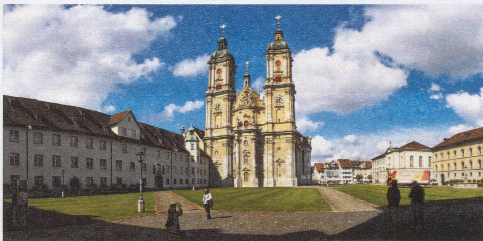
The present cathedral of St. Gallen was built in the 18th century

festival originated in old school customs celebrated on St. Gregory's Day, in memory of Pope Gregory I.