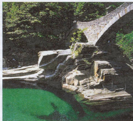
Ponte dei Salti a Lavertezzo