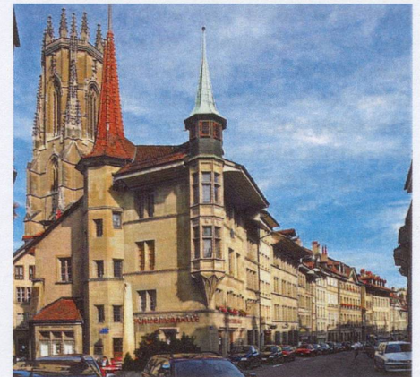
The old city of Fribourg with St Nicholas cathedral

through the town, is the local defining line of the Röstigraben: Fribourg is split roughly 70:30 between French speakers, who are a majority on the western bank; and Swiss-German speakers, who form a majority on the eastern bank. The town's radio station has two separate channels, many streets have two names, and almost everyone is instinctively bilingual. Some of Fribourg's older folk even cling on to the ancient Bolze dialect, a mixture, unsurprisingly, of French and German which you might be able to catch in the taverns and public squares of the Basse-Ville (Lower Town): in Bolze, the town is Frybürg, and you'll hear people calling each other Ggopäingj ("friend").