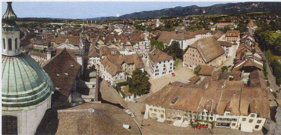
The city of Solothurn with the St Ursus Church on the left

canton of Baselland. Two of the districts are enclaves and are located along the French border.