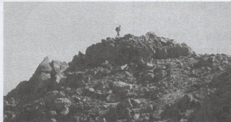
Typically where would you see Vitus but on top of the hill by Meads Wall

old haunt of the Waikato Tramping Club for some, where photos were taken/first lift/meads wall (where Lord of the Rings was filmed) - so different in summer time with no snow around. A weekend enjoyed by all who