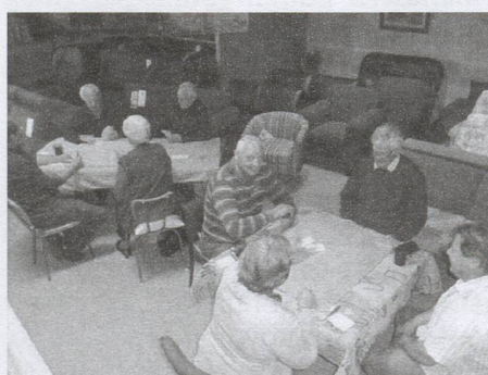
Both teams playing cards

lost. Next was the Shotput which Hamilton won fairly convincingly and because Hamilton had already won the shooting the pressure was on either team to win the Cards but luck wasn't our way and Auckland won this, also