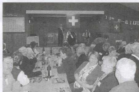
Matangi Hall decorated for the AGM and Fondue Evening