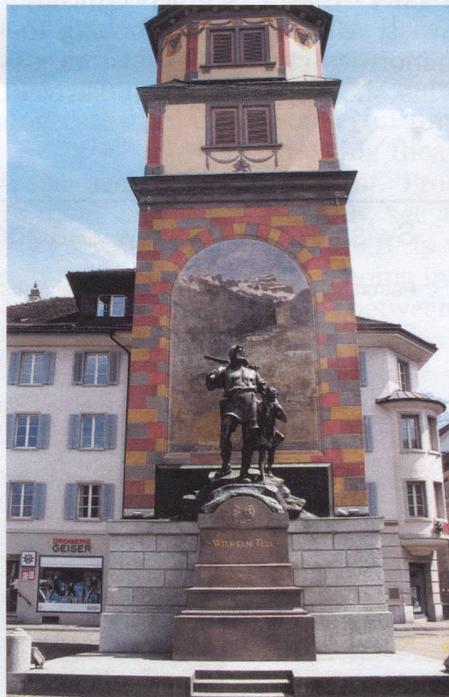
Statue of Wilhelm Tell in Altdorf

tory over the Austrians at Sempach. As a result Uri annexed the lands of Urseren in 1410.