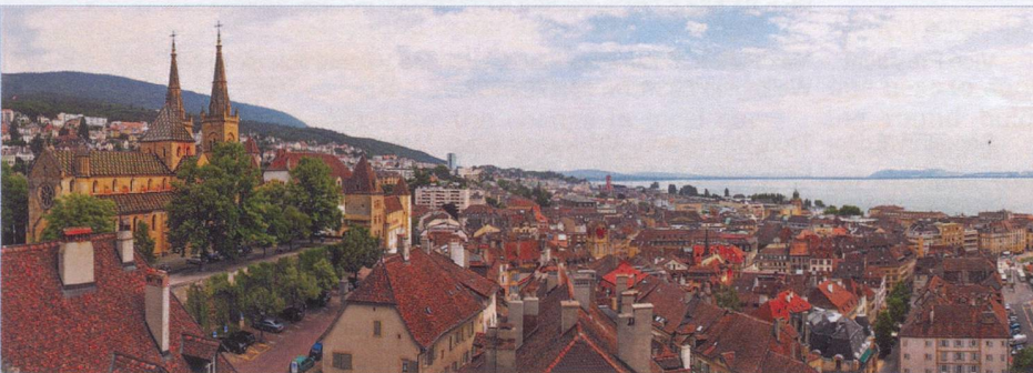
The city of Neuchâtel

The city is located on the northwestern shore of the Lake of Neuchâtel. Above Neuchâtel, roads and train tracks rise steeply into the folds and ridges of the Jura range - known within the canton as the Montagnes