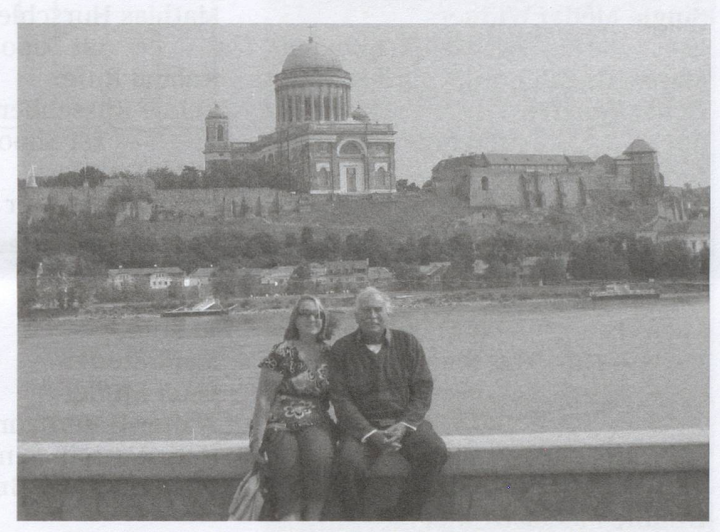
Looking across the Danube from Slovakia to Estergom in Hungary

Decay, destruction and development has fascinated us all the way. Through the eastern countries huge factories built to serve the Soviet relationship are rusting and crumbling. The labourers have disappeared to work in the West, or to try entrepreneurial things. In Albania, every small town has eight or ten "car-washes" ... often