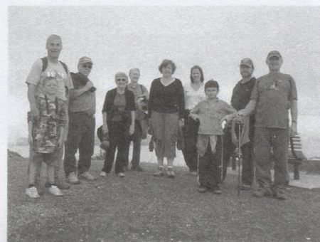
The group that reached the summit

Family Walk - 30 th August at Mount Maunganui - With pouring rain on Sunday morning it did not look like many members would undertake the drive across the Kaimais to join the walk of the Hamilton Swiss Club at Mount Maunganui. Just before 11am, however, the rain stopped and about 25 walkers started the loop track around Mauo. About half of them were keen enough to climb the summit of Mauo via the hidden, steep track about half