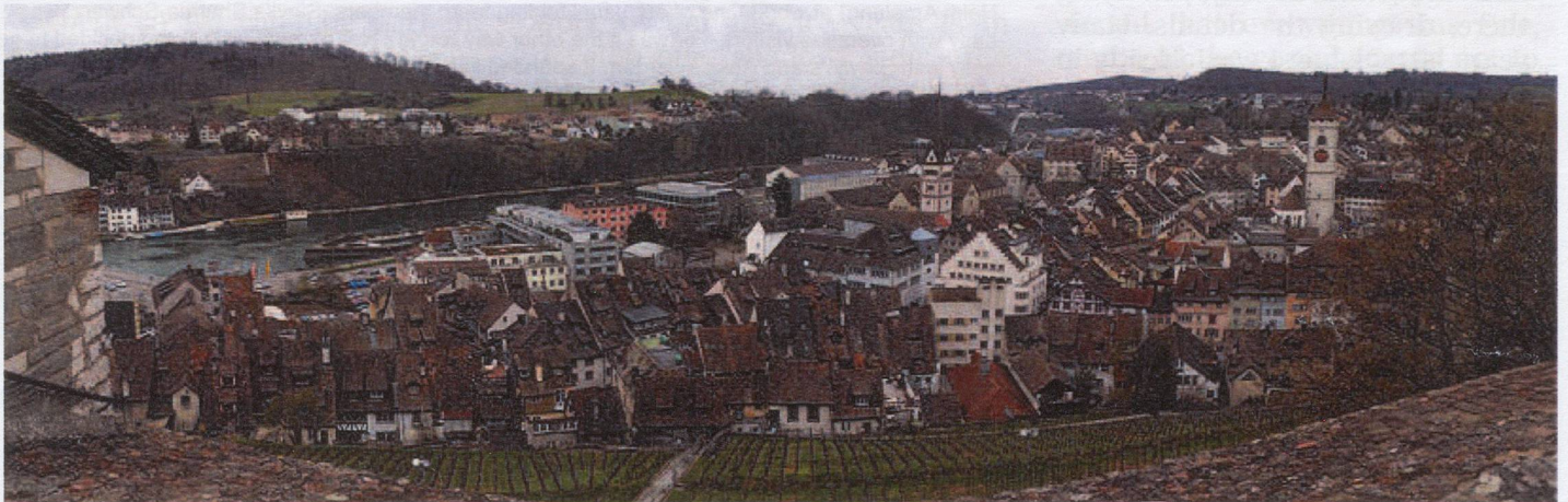
View of the city of Schaffhausen from the Munot

Switzerland. It is mostly productive agricultural land. It lies almost entirely "on the other side" of the river Rhine.