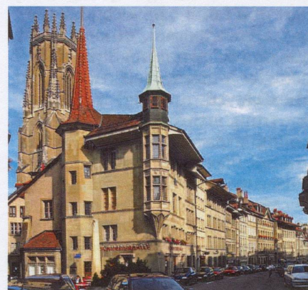
The old city of Fribourg with St Nicholas cathedral

through the town, is the local defining line of the Röstigraben: Fribourg is split roughly 70:30 between French speakers, who are a majority on the western bank; and Swiss-German speakers, who form a majority on the eastern bank. The town's radio station has two separate channels, many streets have two names, and almost everyone is instinctively bilingual. Some of Fribourg's older folk even cling on to the ancient Bolze dialect, a mixture, unsurprisingly, of French and German which you might be able to catch in the taverns and public squares of the Basse-Ville (Lower Town): in Bolze, the town is Frybürg, and you'll hear people calling each other Ggopäingj ("friend").