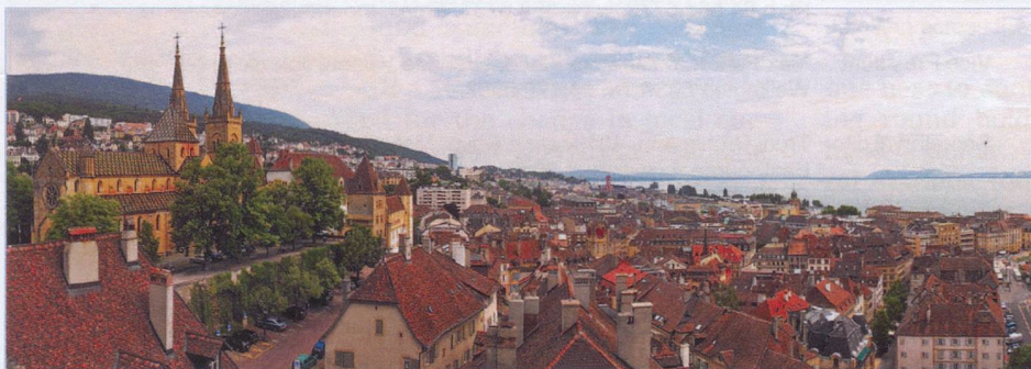
The city of Neuchâtel

In 1011, Rudolf III of Burgundy presented a new castle (French: neu-châtel) on the lake-shore to his wife Irmengarde. The first counts of Neuchâtel were named shortly afterwards, and in 1214 their domain was officially dubbed a city. In 1530, the people of Neuchâtel accepted the Reformation, and their city and territory were proclaimed to be indivisible from then on. Future rulers were required to seek investiture from the citizens.