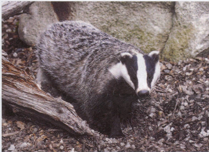
The European Badger or Dachs

Badgers are nocturnal and spend the day in their setts, or extensive networks of tunnels dug in well-drained ground (or sometimes beneath buildings or