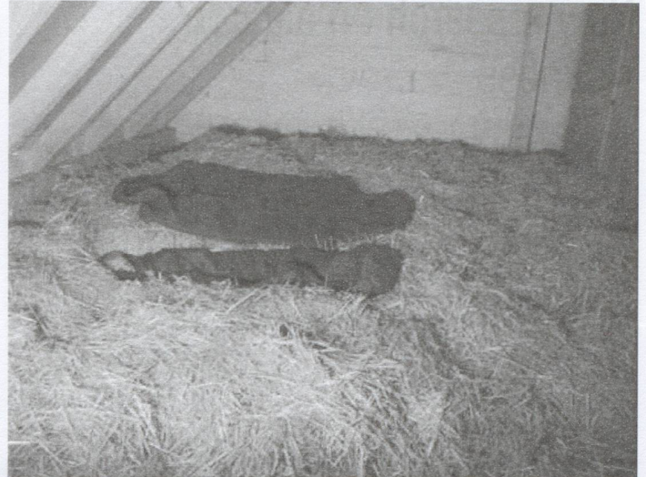
Sleeping on straw

The practice of "FKK" (which stands for "free body culture") is a serious pursuit in Germany. Nudism was already popular at the beginning of the 20th century. It regained popularity after the war, especially in communist East Germany. Since reunification, German FKK fans of all ages sunbathe in the nude