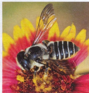
Alfalfa leafcutter bee, Megachile rotundata , a pollinator on alfalfa flower

Most of the improvements in lucerne over the last decades have consisted of better disease resistance on poorly drained soils in wet years, better ability to overwinter in cold climates, and the production of more leaves. Multileaf alfalfa varieties have more than three leaflets per leaf, giving them greater nutritional content by weight because there is more leafy matter